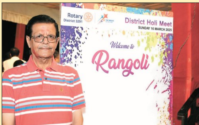
Attending District Holi Meet