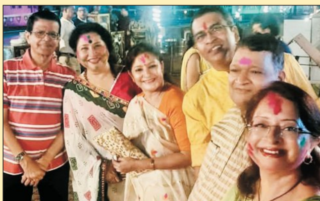
Other participating Rotarians enjoying Rangoli